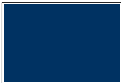
Half Page 7.25" wide x 4.875" high